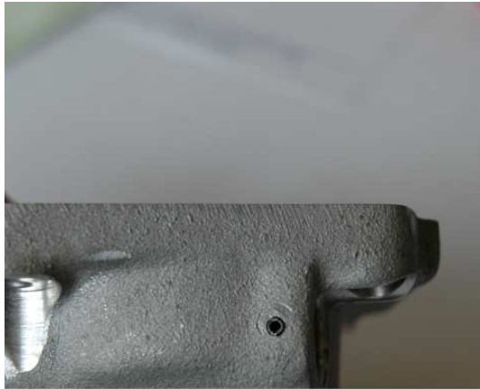
Fig 2: Pin inserted flush with casting

Once the body has been drilled insert the pin across core plug till flush with cast body. (Fig 2). The final result should look as shown in Fig 3