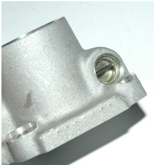
Fig 3: View showing pin inserted across core plug

Titan can perform this service free of charge if required.